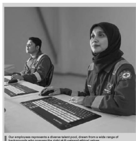
Fig. 2. Diverse Talent

The narrative accounting disclosures explored and investigated on its intertextually basically is limited to the level of the disclosures presented by MedcoEnergy. Therefore, further exploration revealed an image that was stated to represent diverse talents. The figure shows a female working in hijab, which considered to be not conventional in MedcoEnergy. The reason is that most of MedcoEnergy workers are male, as shown in Figure 2 and Figure 3 .